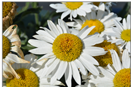
Madonna Shasta Daisy flowers