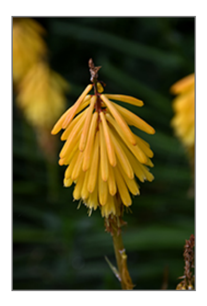
Little Maid Torchlily flowers