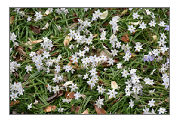
White Star Spring Starflower flowers

This is a relatively low maintenance plant, and usually looks its best without pruning, although it will tolerate pruning. Deer don't particularly care for this plant and will usually leave it alone in favor of tastier treats. It has no significant negative characteristics.