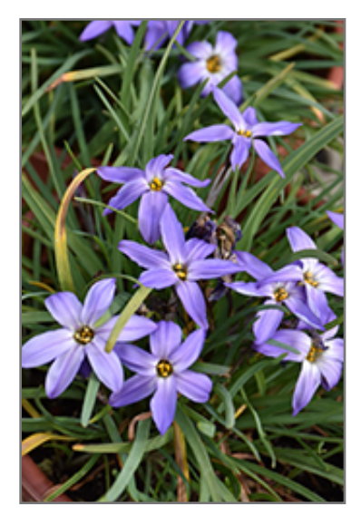
Froyle Mill Spring Starflower flowers

Beautiful lavender, star shaped flowers that are sweetly fragrant in early to mid-spring; grass-like foliage smells like garlic when crushed; a pest resistant variety, great for edging, containers and beds