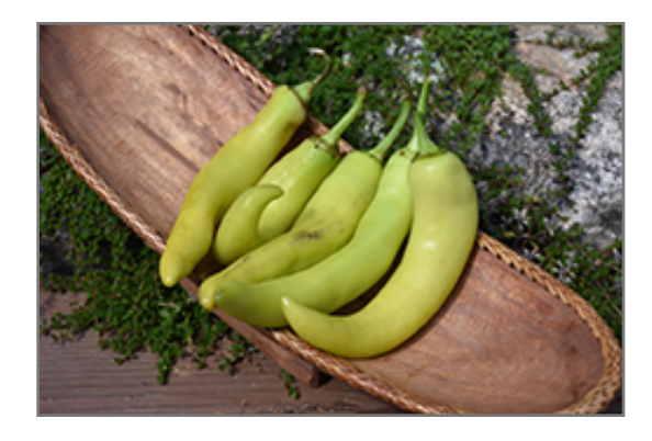
Banana Pepper fruit

Banana Pepper will grow to be about 24 inches tall at maturity, with a spread of 12 inches. When planted in rows, individual plants should be spaced approximately 18 inches apart. This vegetable plant is an annual, which means that it will grow for one season in your garden and then die after producing a crop.