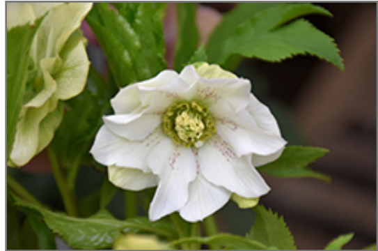
Vavavoom White Hellebore flowers