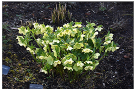
Mellow Yellow Hellebore in bloom