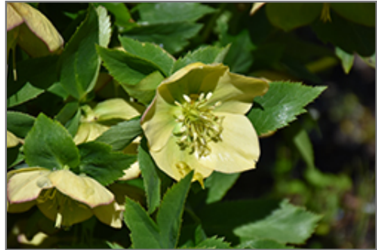
Mellow Yellow Hellebore flowers

Mellow Yellow Hellebore is recommended for the following landscape applications;