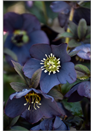
London Fog Hellebore flowers