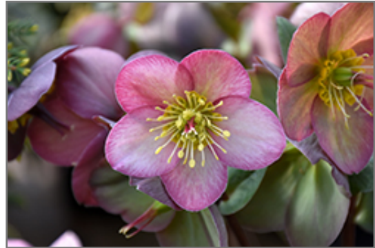
FrostKiss Cheryl's Shine Hellebore flowers

FrostKiss Cheryl's Shine Hellebore is an herbaceous evergreen perennial with an upright spreading habit of growth. Its medium texture blends into the garden, but can always be balanced by a couple of finer or coarser plants for an effective composition.