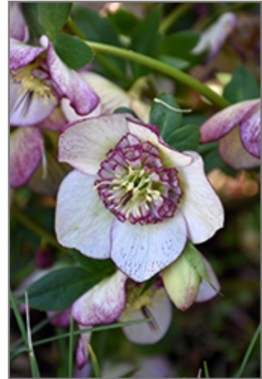
Carousel Strain Hellebore flowers