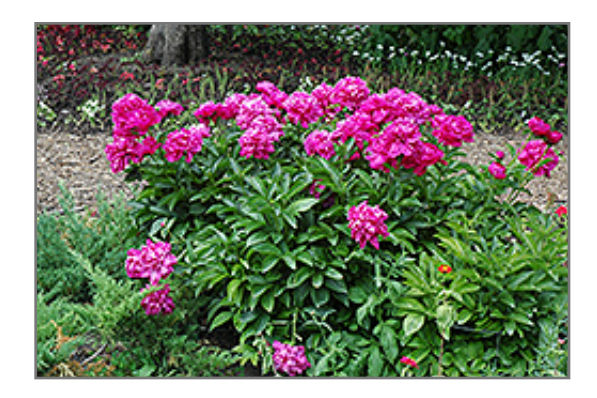
Music Man Peony in bloom