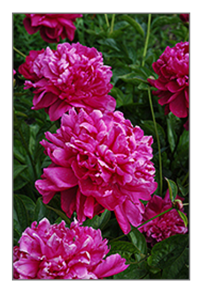
Music Man Peony flowers