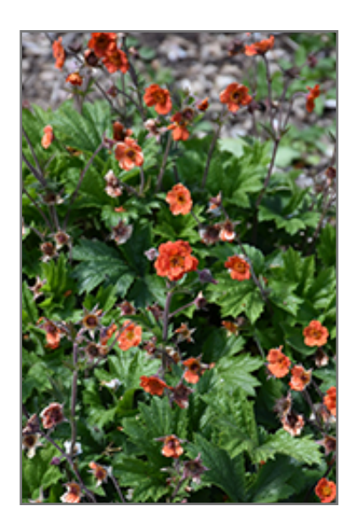
Rustico Orange Avens flowers

Rustico Orange Avens is a fine choice for the garden, but it is also a good selection for planting in outdoor pots and containers. It is often used as a 'filler' in the 'spiller-thriller-filler' container combination, providing a mass of flowers against which the larger thriller plants stand out. Note that when growing plants in outdoor containers and baskets, they may require more frequent waterings than they would in the yard or garden. Be aware that in our climate, most plants cannot be expected to survive the winter if left in containers outdoors, and this plant is no exception. Contact our experts for more information on how to protect it over the winter months.