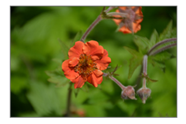
Rustico Orange Avens flowers