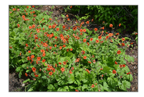
Rustico Orange Avens in bloom

Rustico Orange Avens is an herbaceous perennial with tall flower stalks held atop a low mound of foliage. Its relatively fine texture sets it apart from other garden plants with less refined foliage.