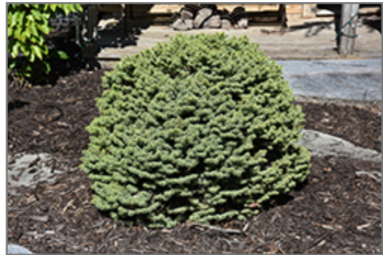
Dwarf Serbian Spruce