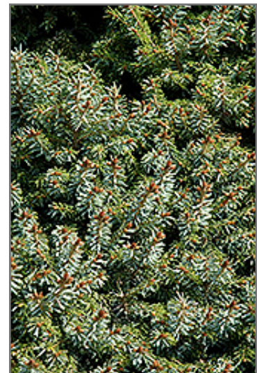
Dwarf Serbian Spruce foliage