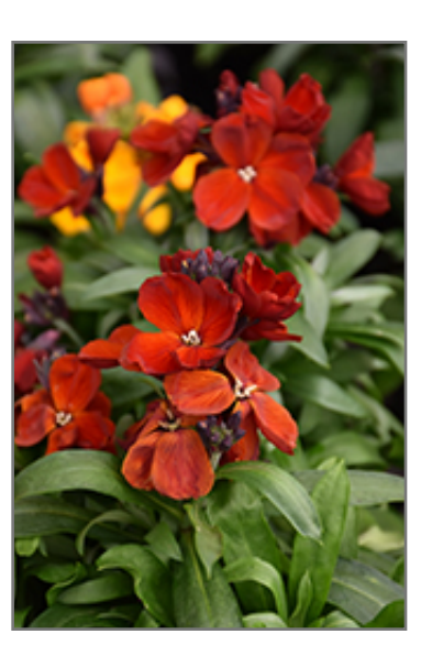
Sugar Rush Red Wallflower flowers

Fragrant, rich red flowers bloom in spring, then again in fall over dark green foliage; a self-seeding biennial, but can be planted annually; vigorous, drought resistant, and great for containers, beds, or borders; deadhead after flowering