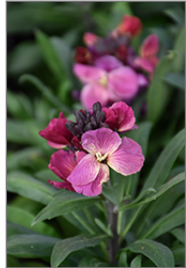
Sugar Rush Purple Bicolor Wallflower flowers

Sugar Rush Purple Bicolor Wallflower is recommended for the following landscape applications;