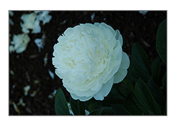
Marcella Peony flowers

Marcella Peony features bold lightly-scented double white flowers at the ends of the stems from late spring to early summer. The flowers are excellent for cutting. Its compound leaves remain green in colour throughout the season.