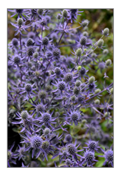
Sunny Jackpot Variegated Sea Holly flowers

Rounded blue-green variegated foliage with creamy yellow edges; spectacular thistle-like, steel-blue flowers on dark purple stems; tolerates hot dry sites; attractive to butterflies; pair up with softer textured plants, beautiful in dried arrangements