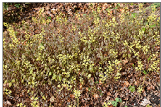
Colchian Barrenwort in bloom