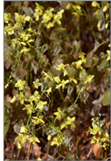
Colchian Barrenwort flowers