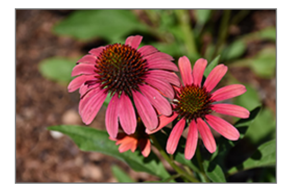
SunSeekers Coral Coneflower flowers

SunSeekers Coral Coneflower is recommended for the following landscape applications;