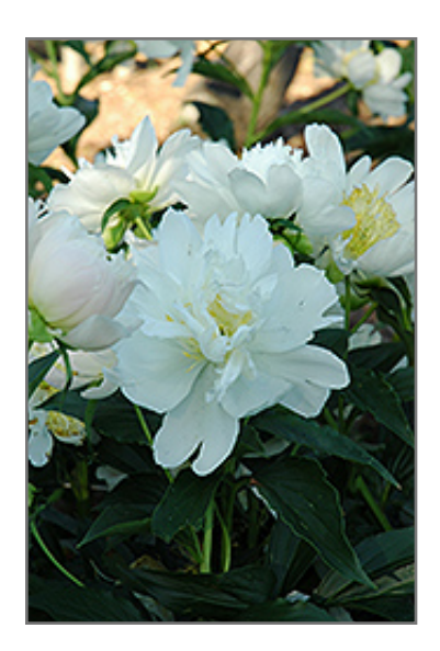
Lotus Queen Peony flowers

Lotus Queen Peony will grow to be about 30 inches tall at maturity, with a spread of 3 feet. When grown in masses or used as a bedding plant, individual plants should be spaced approximately 30 inches apart. The flower stalks can be weak and so it may require staking in exposed sites or excessively rich soils. It grows at a slow rate, and under ideal conditions can be expected to live for approximately 20 years. As an herbaceous perennial, this plant will usually die back to the crown each winter, and will regrow from the base each spring. Be careful not to disturb the crown in late winter when it may not be readily seen!