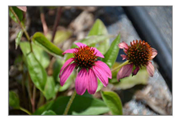
Amazing Dream Coneflower flowers