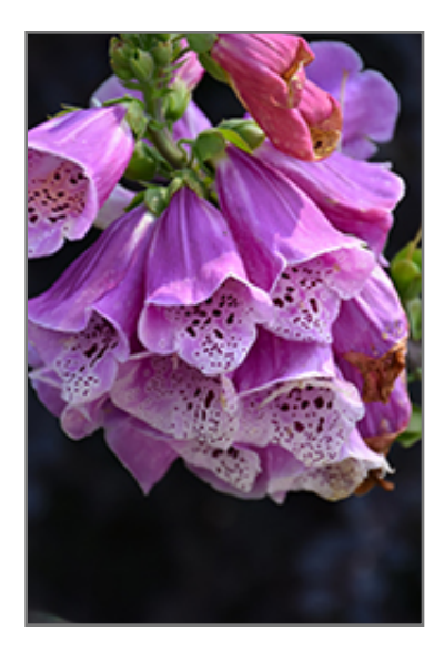
Excelsior Group Foxglove flowers

Excelsior Group Foxglove is recommended for the following landscape applications;