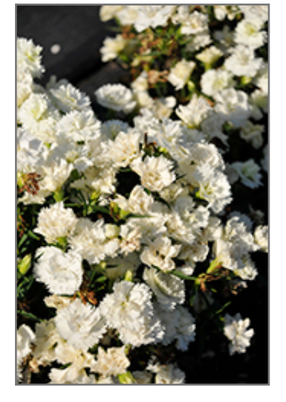
Constant Promise White Pinks flowers

Vivid, pure white flowers above mounds of fine green foliage; beautifully fragrant, and great for flower arrangements; deadhead to encourage reblooming; excellent heat tolerance; great for beds or containers