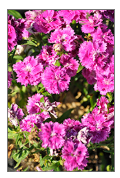
Constant Promise Raspberry Pinks flowers

Vivid, raspberry pink flowers above mounds of fine silvery blue-green foliage; beautifully fragrant, and great for flower arrangements; deadhead to encourage reblooming; excellent heat tolerance; great for beds or containers