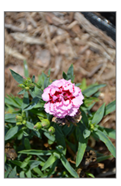
Constant Beauty Pink Red Pinks flowers

Frilly flowers are pink, with burgundy red centers and edges, above mounds of fine gray green foliage; fragrant; great for flower arrangements; deadhead to encourage reblooming; pair up with summer blooming perennials; excellent for beds or containers