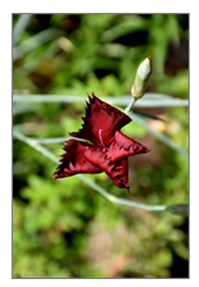
Grenadin King Of The Blacks Carnation flowers

Grenadin King Of The Blacks Carnation is recommended for the following landscape applications;