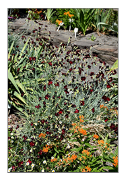
Grenadin King Of The Blacks Carnation in bloom