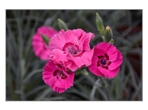
American Pie Bumbleberry Pie Pinks flowers

performance; sturdy stems are great for flower arrangements; deadhead to encourage reblooming;