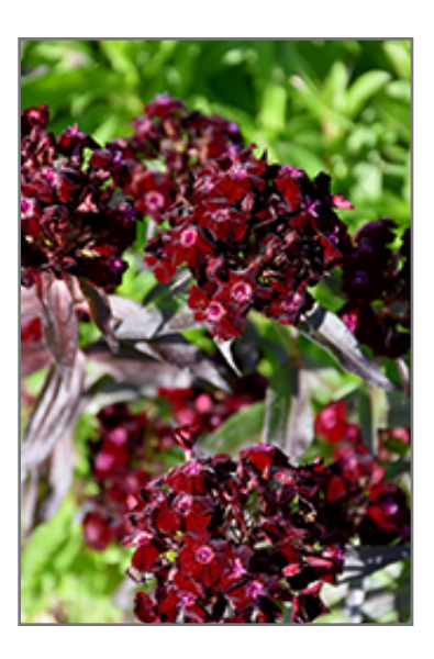
Sooty Sweet William flowers

Deliciously clove-scented, velvety frilly chocolate-burgundy flowers with brighter pink centers; optimal site has full sun with ample moisture, and deep, rich, well drained soil; seeds freely but divide for truest color