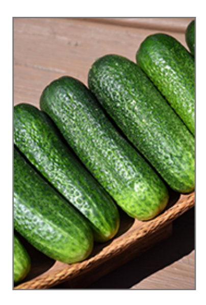
Homemade Pickles Cucumber fruit