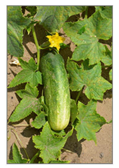
Homemade Pickles Cucumber fruit

Homemade Pickles Cucumber will grow to be about 10 inches tall at maturity, with a spread of 5 feet. When planted in rows, individual plants should be spaced approximately 12 inches apart. This fast-growing vegetable plant is an annual, which means that it will grow for one season in your garden and then die after producing a crop.