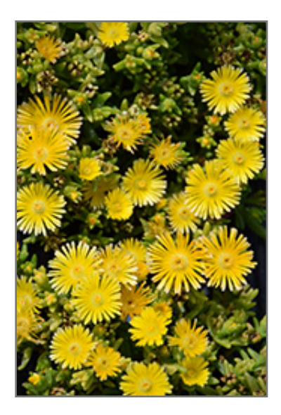
Suntropics Yellow Ice Plant flowers