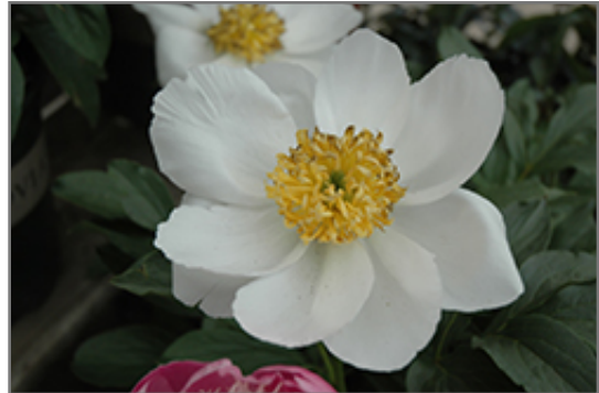
Jan Van Leeuwen Peony flowers