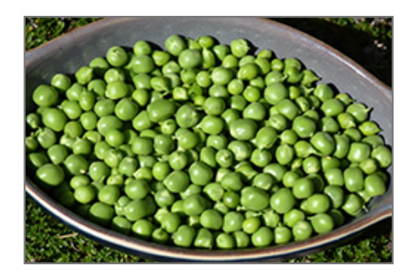
Garden Pea fruit