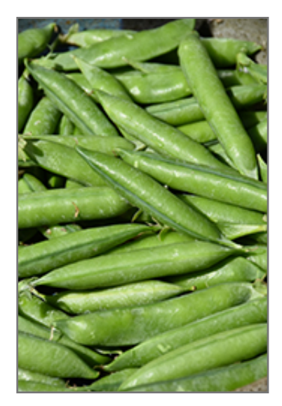
Garden Pea fruit