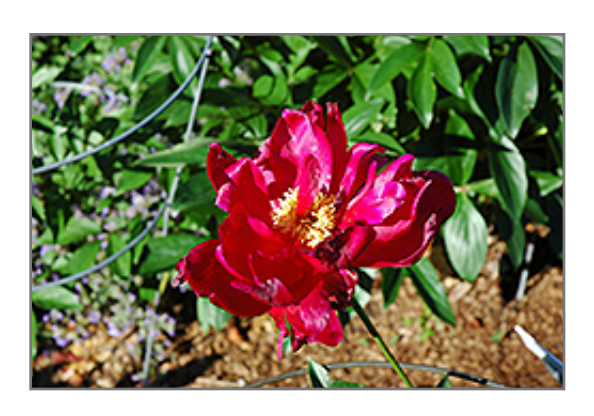
Florence Bruss Peony flowers

Florence Bruss Peony features bold lightly-scented semi-double cherry red flowers with yellow anthers at the ends of the stems from late spring to early summer. The flowers are excellent for cutting. Its compound leaves remain green in colour throughout the season.