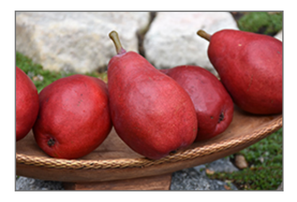
Red Sensation Bartlett Pear fruit

Red Sensation Bartlett Pear is covered in stunning clusters of white flowers along the branches in early spring. It has forest green deciduous foliage. The glossy pointy leaves turn an outstanding deep purple in the fall. The fruits are showy red pears carried in abundance in early fall. The fruit can be messy if allowed to drop on the lawn or walkways, and may require occasional clean-up.