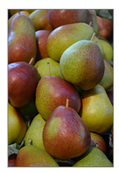
Forelle Pear fruit

Forelle Pear is bathed in stunning clusters of white flowers along the branches in early spring. It has forest green deciduous foliage. The glossy pointy leaves turn an outstanding deep purple in the fall. The fruits are showy chartreuse pears with red spots and which fade to gold over time, which are carried in abundance from mid to late summer. The fruit can be messy if allowed to drop on the lawn or walkways, and may require occasional clean-up.