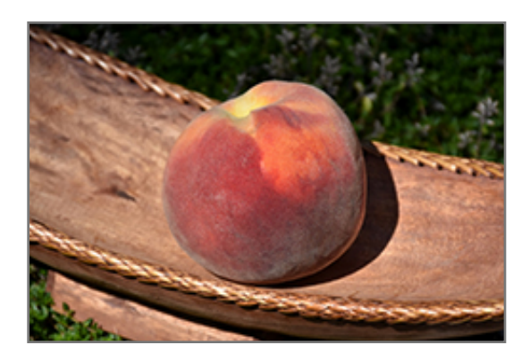
Ventura Peach fruit

Ventura Peach is smothered in stunning clusters of fragrant pink flowers along the branches in early spring, which emerge from distinctive rose flower buds before the leaves. It has dark green deciduous foliage. The narrow leaves turn yellow in fall. The fruits are showy gold drupes with a red blush, which are carried in abundance in mid summer. The fruit can be messy if allowed to drop on the lawn or walkways, and may require occasional clean-up.