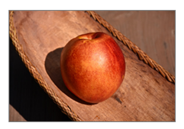
Pacific Pride Nectarine fruit

An exceptional selection, producing abundant crops of nectarines with smooth red skins, and sweet, juicy white flesh; very resistant to peach leaf curl; susceptible to late spring freezes and disease, needs full sun and well-drained soil