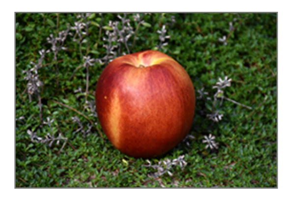
Flavortop Nectarine fruit

An exceptional selection, producing large, freestone nectarines with great flavor, smooth red skin, and sweet yellow flesh; high yield with excellent vigor; susceptible to late spring freezes and disease, needs full sun and well-drained soil