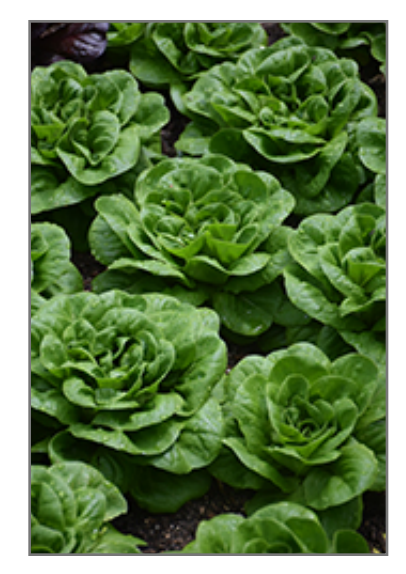
Buttercrunch Lettuce

Buttercrunch Lettuce will grow to be about 12 inches tall at maturity, with a spread of 6 inches. When planted in rows, individual plants should be spaced approximately 8 inches apart. This vegetable plant is an annual, which means that it will grow for one season in your garden and then die after producing a crop. Because of its relatively short time to maturity, it lends itself to a series of successive plantings each staggered by a week or two; this will prolong the effective harvest period.