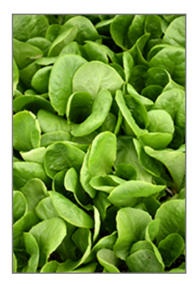
Buttercrunch Lettuce foliage