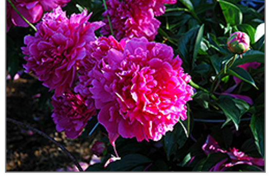
Douglas Brand Peony flowers

Douglas Brand Peony will grow to be about 30 inches tall at maturity, with a spread of 3 feet. When grown in masses or used as a bedding plant, individual plants should be spaced approximately 30 inches apart. The flower stalks can be weak and so it may require staking in exposed sites or excessively rich soils. It grows at a slow rate, and under ideal conditions can be expected to live for approximately 20 years. As an herbaceous perennial, this plant will usually die back to the crown each winter, and will regrow from the base each spring. Be careful not to disturb the crown in late winter when it may not be readily seen!