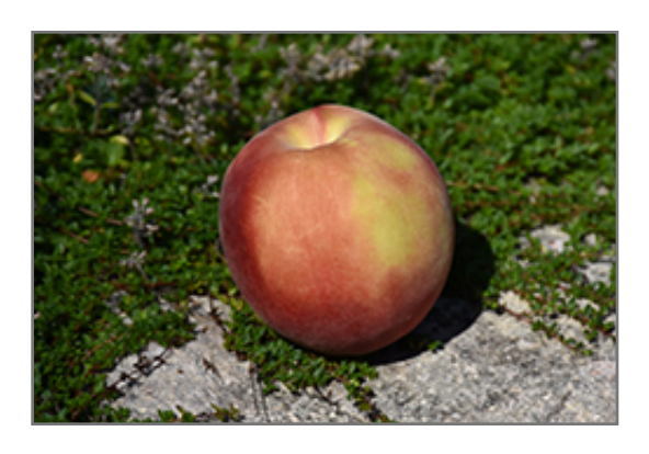
Strawberry Free Peach fruit

An exceptional variety, with showy, pink flowers in spring, followed by large, freestone peaches with very sweet white flesh and creamy skins, blushed with red; superb aromatic flavor; susceptible to late spring freezes and disease