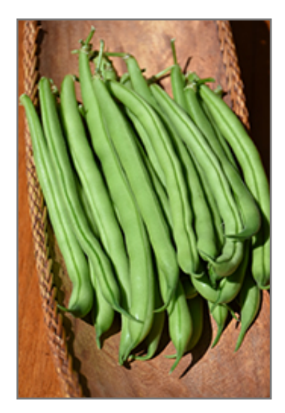
Blue Lake Bush Bean fruit

Blue Lake Bush Bean will grow to be about 18 inches tall at maturity, with a spread of 16 inches. When planted in rows, individual plants should be spaced approximately 6 inches apart. This fast-growing vegetable plant is an annual, which means that it will grow for one season in your garden and then die after producing a crop.