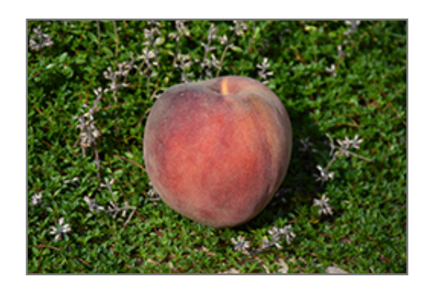
O'Henry Peach fruit

O'Henry Peach is smothered in stunning clusters of fragrant pink flowers along the branches from early to mid spring, which emerge from distinctive rose flower buds before the leaves. It has dark green deciduous foliage. The glossy narrow leaves turn yellow in fall. The fruits are showy gold drupes with a red blush, which are carried in abundance from mid to late summer. The fruit can be messy if allowed to drop on the lawn or walkways, and may require occasional clean-up.