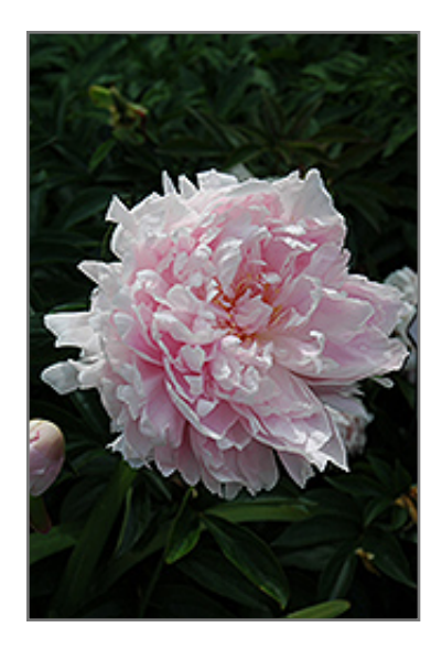
Dolorodell Peony flowers

Dolorodell Peony will grow to be about 30 inches tall at maturity, with a spread of 3 feet. When grown in masses or used as a bedding plant, individual plants should be spaced approximately 30 inches apart. The flower stalks can be weak and so it may require staking in exposed sites or excessively rich soils. It grows at a slow rate, and under ideal conditions can be expected to live for approximately 20 years. As an herbaceous perennial, this plant will usually die back to the crown each winter, and will regrow from the base each spring. Be careful not to disturb the crown in late winter when it may not be readily seen!