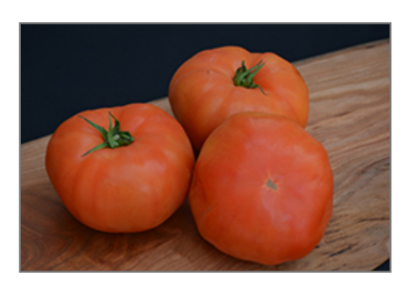
Classic Beefsteak Tomato fruit

Growing upwards of 8 feet, the beefsteak tomato is a highly sought out selection for its awesome flavor and texture; coming in bright red, purple and even pink, these favorites are perfect for BLT and tomato sandwiches, burgers and so much more