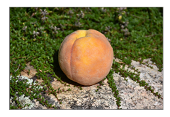
Golden Glory Peach fruit

Golden Glory Peach is smothered in stunning clusters of fragrant rose flowers along the branches in early spring, which emerge from distinctive dark red flower buds before the leaves. It has dark green deciduous foliage. The glossy narrow leaves turn yellow in fall. The fruits are showy yellow drupes with a scarlet blush, which are carried in abundance in mid summer. The fruit can be messy if allowed to drop on the lawn or walkways, and may require occasional clean-up.