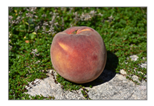
Elegant Lady Peach fruit

Elegant Lady Peach is smothered in stunning clusters of fragrant shell pink flowers along the branches from early to mid spring, which emerge from distinctive rose flower buds before the leaves. It has dark green deciduous foliage. The narrow leaves turn yellow in fall. The fruits are showy dark red drupes with hints of yellow, which are carried in abundance from mid to late summer. The fruit can be messy if allowed to drop on the lawn or walkways, and may require occasional clean-up.