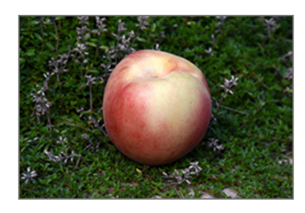
Arctic Supreme Peach fruit

Arctic Supreme Peach is smothered in stunning clusters of fragrant shell pink flowers along the branches in early spring, which emerge from distinctive rose flower buds before the leaves. It has green deciduous foliage. The narrow leaves turn yellow in fall. The fruits are showy buttery yellow drupes with a scarlet blush, which are carried in abundance in mid summer. The fruit can be messy if allowed to drop on the lawn or walkways, and may require occasional clean-up.