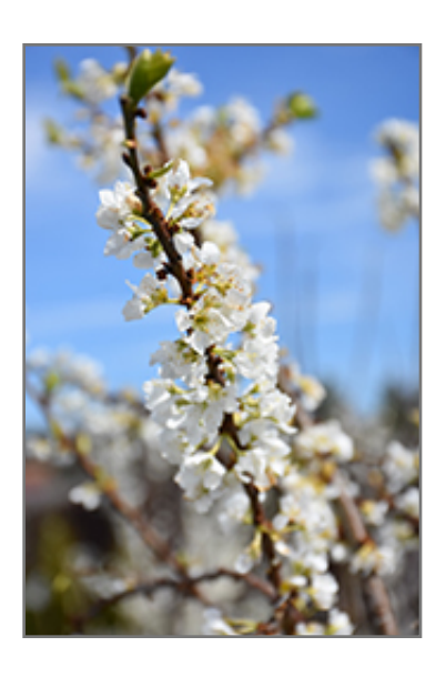
Flavor Supreme Pluot flowers

Flavor Supreme Pluot is clothed in stunning clusters of fragrant white flowers along the branches from early to mid spring before the leaves. It has forest green deciduous foliage. The pointy leaves turn yellow in fall. The fruits are showy light green drupes mottled with burgundy, which are carried in abundance from early to mid summer. The fruit can be messy if allowed to drop on the lawn or walkways, and may require occasional clean-up.