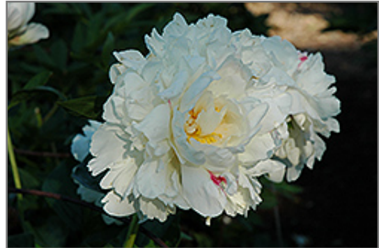
Carl. G. Klehm Peony flowers